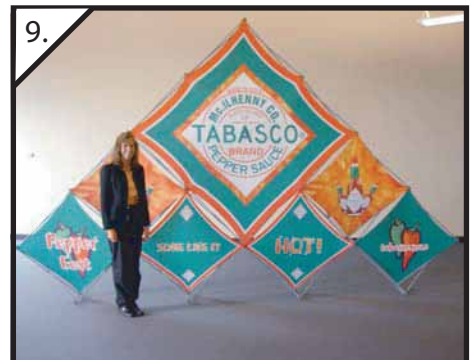
7. Enjoy your display!