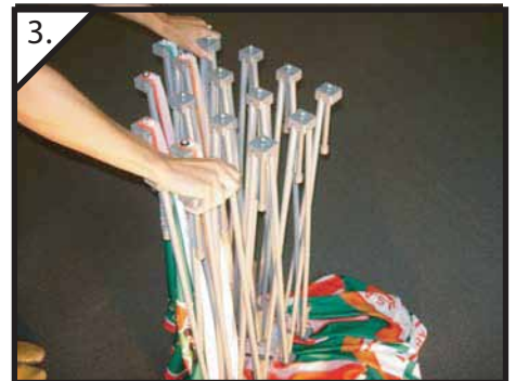
3. Separate the frame slightly. Make sure graphics are not caught on frame or connectors.