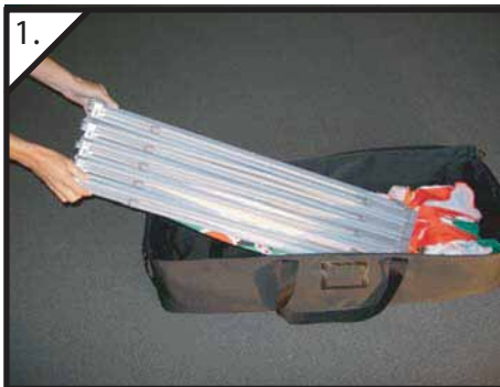
1. Unpack the display.

PLEASE READ CAREFULLY BEFORE SETTING UP YOUR DISPLAY! AVOID DAMAGE TO YOUR DISPLAY, USE PROPER SET-UP PROCEDURE.