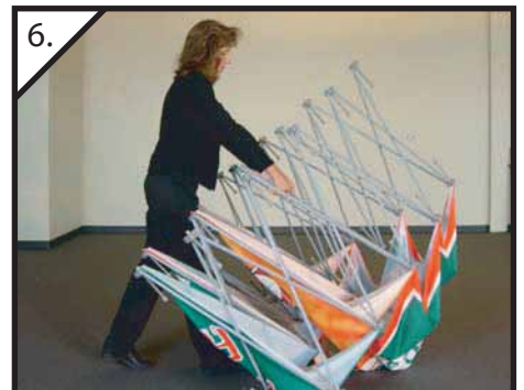
6. With an even and controlled motion, extend your arms up and out, until you hear the snap!