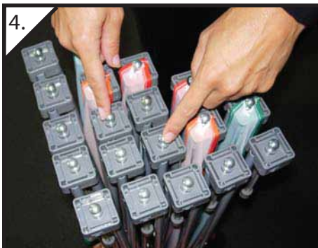
4. Locate center hubs.