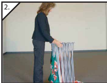
2. Place the frame on the floor - graphic side down; feet facing you.